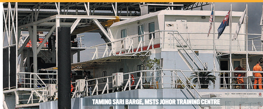
TAMING SARI BARGE, MSTS JOHOR TRAINING CENTRE