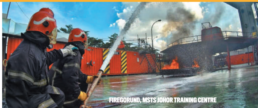
FIREGORUND, MSTS JOHOR TRAINING CENTRE