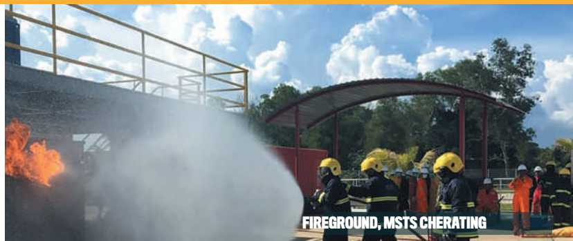
FIREGROUND, MSTS CHERATING