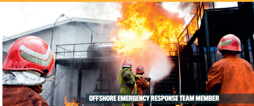
OFFSHORE EMERGENCY RESPONSE TEAM MEMBER