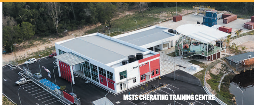
MSTS CHERATING TRAINING CENTRE