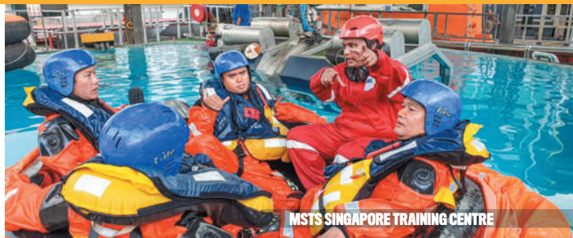
MSTS SINGAPORE TRAINING CENTRE