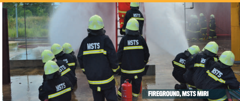
FIREGROUND, MSTS MIRI