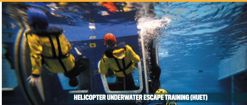
HELICOPTER UNDERWATER ESCAPE TRAINING (HUET)